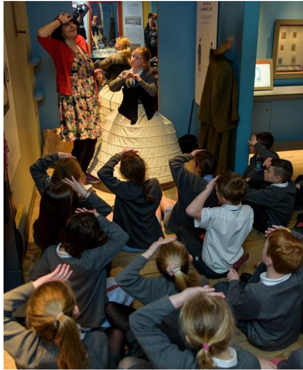
Image credit: Museums & Schools prize draw winners at the V&A, London

Looking at shapes and patterns in a variety of objects and artefacts, pupils will be inspired to create their own print to take back to school.